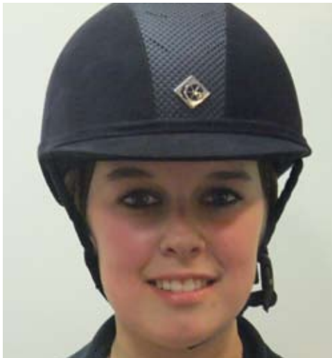
Hair is neatly contained under the helmet.

Choose a hair net that closely matches your hair color. Hair nets are available in a variety of colors and in heavy weight too for very thick hair. You may favor a One Knot Hair Net designed for the knot to be tied at the back with a matching hair band, leaving the front smooth and comfortable under your helmet.